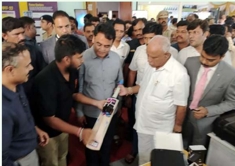
Shri B. S. Yeddyurappa, Chief Minister & Shri C. N. Ashwath Narayan, Dy. Chief Minister of Karnataka with CoE startups on 11th December 2019 in Bangalore