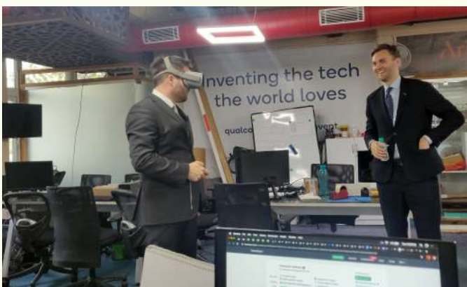
Delegation from Denmark paid a visit to CoE on 5th Nov'19