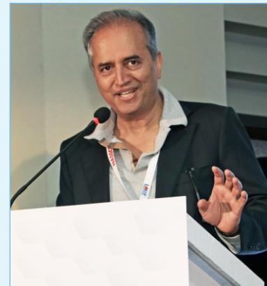
DR DEVI PRASAD SHETTY Chairman & Founder, Narayana Health

Dr Devi Prasad Shetty spoke extensively of the availability of medical data in India, and how this data should be responsibly used for the betterment of AI, which can have a profound impact on healthcare delivery systems, prognosis, diagnosis and treatment. Worldwide there is a loss of about $3 trillion USD due to errors in medical reporting. This is also the third leading cause of deaths in the world. With 70 million diabetics in India, we are the diabetic capital of the world. A learning curve of 14 years to train a Diabetologist. With only about 600 of them available in India, tech interventions is necessary to overcome the capacity constraint.